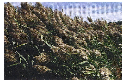
Phragmites stands during summer.

Although it is uncommon, native phragmites can be found in some areas. Before attempting to control phragmites, it is important to identify the native phragmites versus the non-native, invasive variety. Additional information on how to identify native versus non-native phragmites can be found at www.invasiveplants.net/phragmites/phrag/morph.htm .