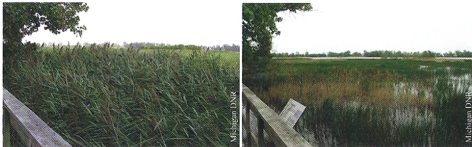
Photo on the left: A treatment site in Sterling State Park with a dense stand of phragmites prior to any treatment. Photo on the right: A treatment site shown in the spring after a fall herbicide treatment using a glyphosate/imazapyr combination followed by a winter

No biological control methods for phragmites are currently available. However, researchers at Cornell University are studying several insects native to Europe that are known to attack phragmites as possible biological controls. For more information, visit http://invasiveplants.net .