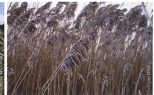
Phragmites stands during winter.